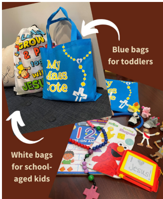
Blue bags for toddlers